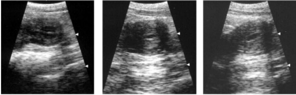
Figure 1. Ultrasonographic images of non-pregnant (A) and pregnant uterus on day 12 (B) and day 15 (C) after ovulation.

smears did not exhibit eosinophilic cells during the advanced follicular phase.